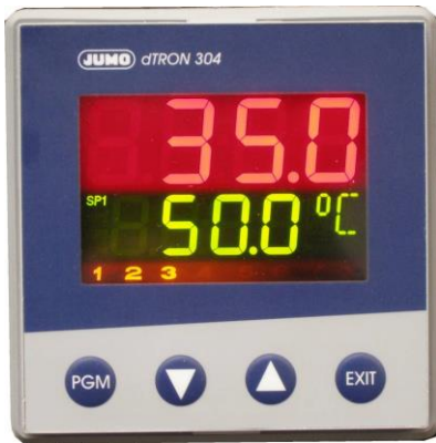
Figure 1 Jumo dTRON controller