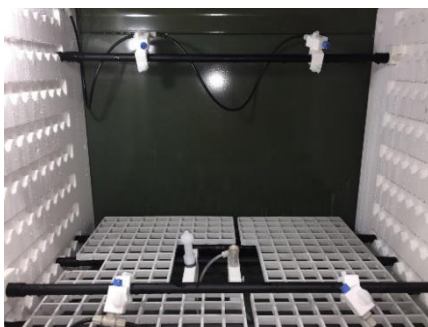
Option: System for specimen treatment