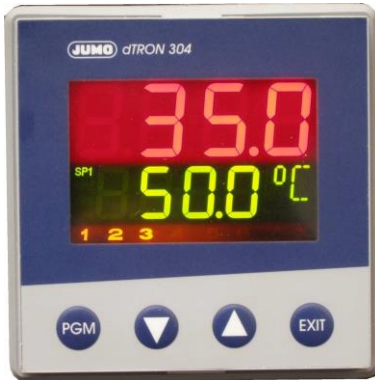
Jumo dTRON controller