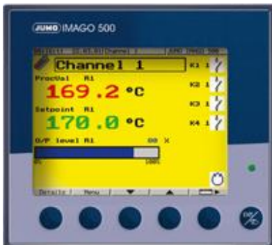
Figure 1 Jumo Imago 500 controller