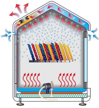
Figure 1 Patented Controlled Water Condensation (CWC) system

-ISO 6270-2 -BS 3900F2, BS 3900 F15 -ASTM D2242